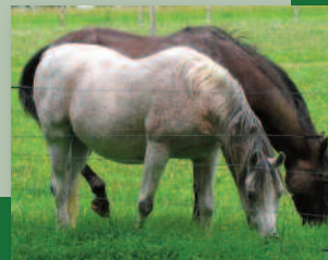
Morris Land Conservancy

Quality of Life – Preserving lands that help protect our water supply not only retains many of the natural resources necessary to our survival but also helps preserve the scenic character and historic heritage of the Highlands for all to enjoy.