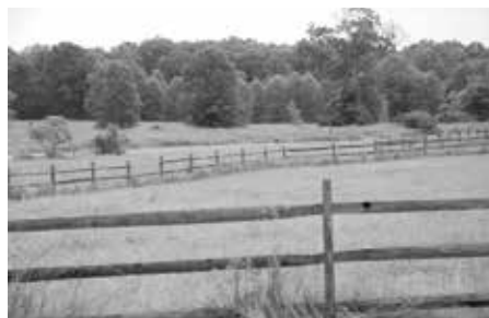
Farm field in the Pequest watershed