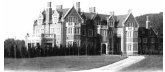
Rutherford Hall in the 1920's. Story inside.