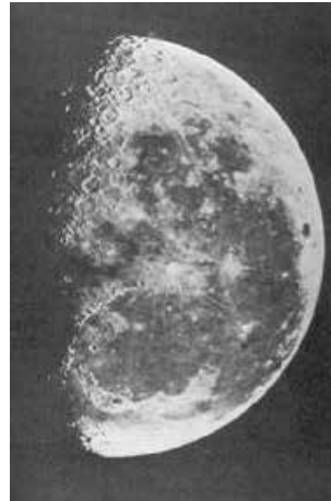
Moon