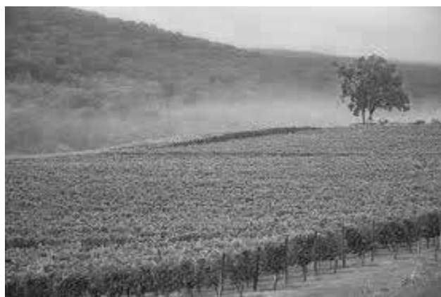
Alba's vineyards, near Finesville in Pohatcong, Twp.

For a wonderful time, plan a winery tour. Many have special events ranging from elegant dinners to Harvest Day festivals. Many are prepared to host your own special events from weddings to corporate get-togethers or group outings. Some provide Bed & Breakfast accommodations. Just remember: call ahead, designate a driver and have a good time! Pj