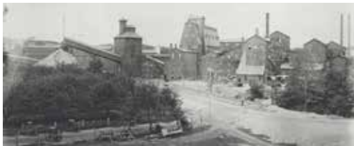
Edison's Highlands mining operation in Sparta

It is not widely known that Thomas Edison set up a mining company in Sussex County, specifically, Sparta Township. Edison was hugely successful in the City of Menlo Park, where he built the first industrial research laboratory, but he was not so successful