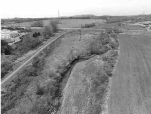
Drone camera view of Lopatcong Creek in Lopatcong Twp. by Flying Turtle Studio, which has donated its services to help map watershed features for Lopatcong Creek Initiative

We submitted considerably researched, comprehensive and persuasive comments opposing the agreement (that may be viewed via a link on our home page). We are considering further actions if the proposed agreement is adopted. NJRC