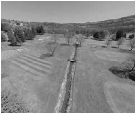
Drone photo of Lopatcong Creek at Harker's Hollow Golf & Country Club, Harmony

NJ Audubon is preparing a project of riparian restoration to stabilize eroded