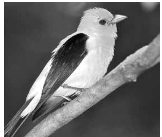
Scarlet Tanager