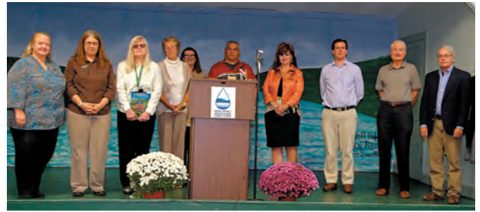
On hand to receive Small Grant awards were Highlands Nature Friends, Rockaway Borough Conservation Alliance, Ramapough Conservancy, Friends of the Musconetcong, Coalition Against Pilgrim Pipeline, and the Tewksbury Coalition

Groups were also on hand to receive checks as recipients of our 2017 Small Grants Awards. See caption at upper right for those organizations on hand to accept Small Grants.