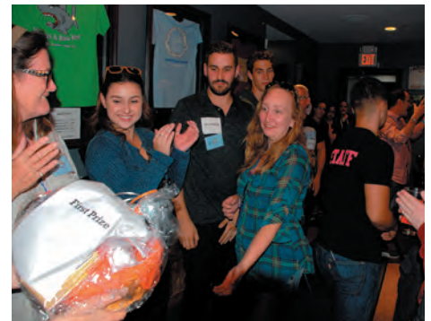
First Place winner at the Boonton Pub Crawl